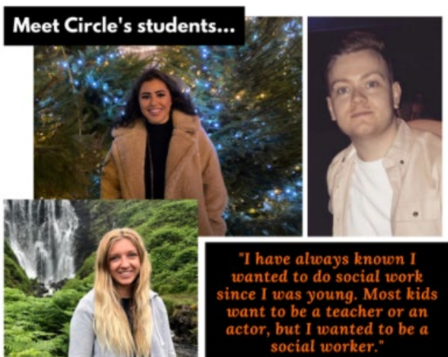
Intake of students, March 2021

The coming year will be a challenging one, trying to reduce the impact of COVID-19. The impact of the pandemic will continue for the near future as universities across Scotland endeavour to fulfil the backlog of placements which has developed. The numbers of placements next year will be lower due to the knock-on effect of the suspended placements. Multiple universities will be looking to secure placements at the same time to fulfil their obligations to students. A small practice learning unit such as ours will struggle to offer placements to all our usual partners. The Project Manager has been liaising closely with university representatives to reduce the impact on future placements.